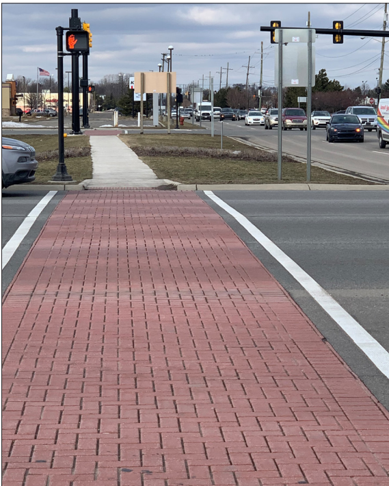
EXAMPLE OF ENHANCED PEDESTRIAN CROSSING