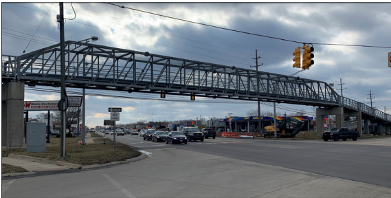
EXAMPLE OF PEDESTRIAN BRIDGE